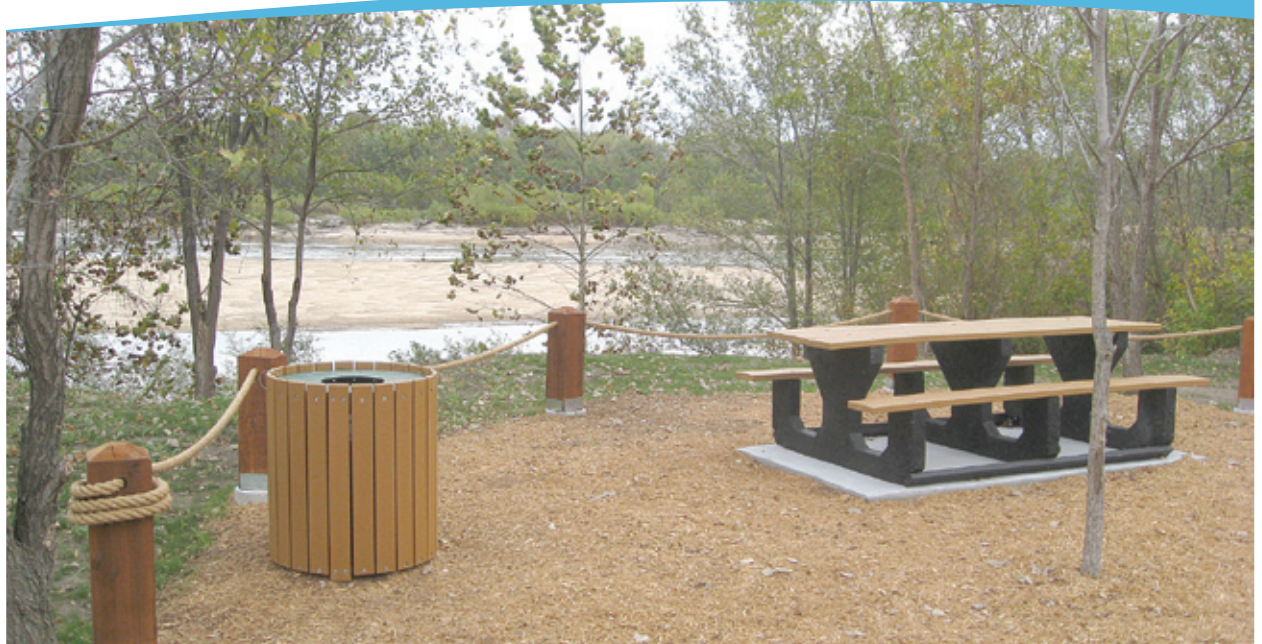
▲ The completed picnic area provided by Great American Bank is now available for public use, along with the picnic area provided by De Soto Rotary.

With the equal generosity of the De Soto Rotary Club, the public can take advantage of three picnic