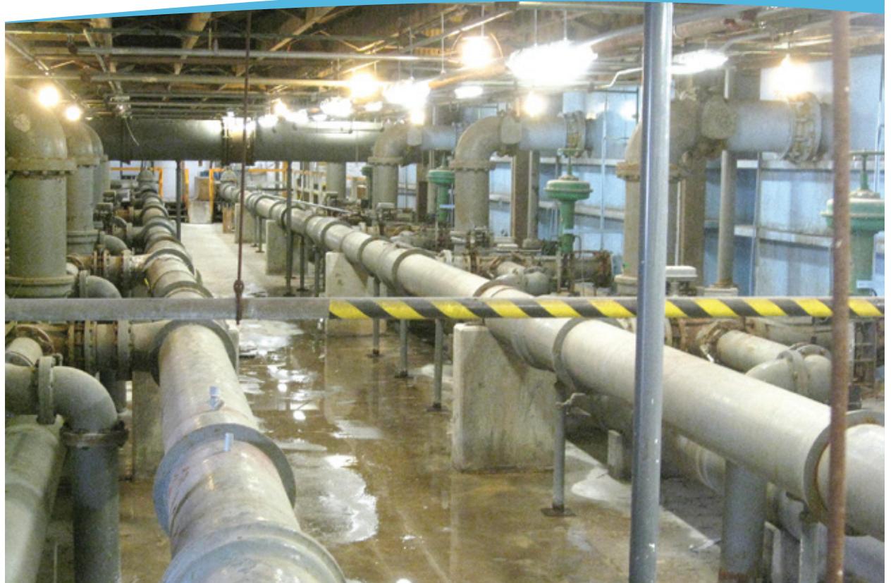
▲ New lighting system at the water plant is first step in overhauling some of the plant's electrical service.

The Army built the existing 12" distribution line in the 1940's and is today the source of frequent breaks and loss of service (thus the