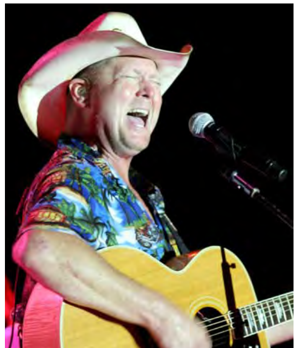
Grammy-nominated country music star Tracy Lawrence performed his hit songs, and hits a high note during "Paint Me a Birmingham".