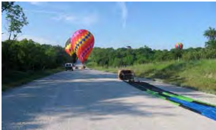
Photo taken by Darrel Zimmerman of hot air balloons touching down on Waverly Road in De Soto on Memorial Weekend.

Dive, Decide, and Depart are junk-out steps. Start Now!